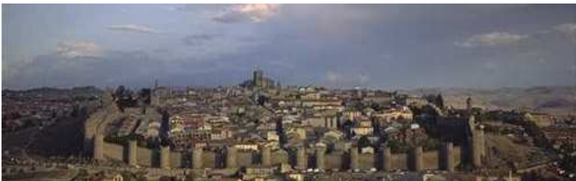
The City Wall. Full Panoramic

Ávila is also a modern, dynamic city offering students many different possibilities for enjoyment and leisure. In this unparalleled setting, the Catholic University of Avila is able to give foreign students a wonderful opportunity to learn and improve Spanish and to broaden their knowledge of Spanish civilization and culture.