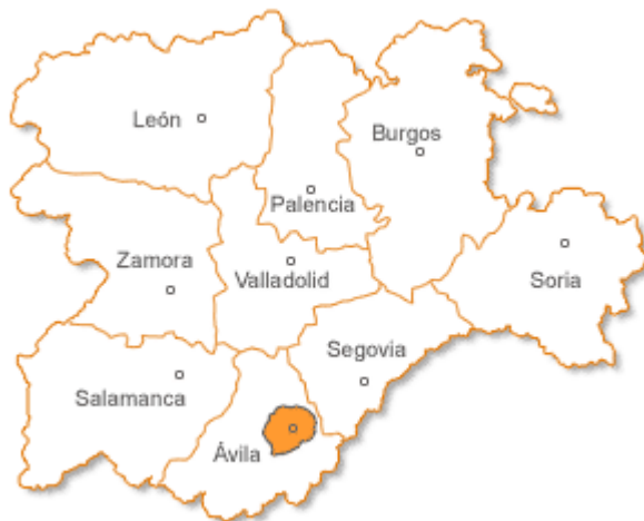
High altitude mountain scenery, next to the Sierra de Gredos.